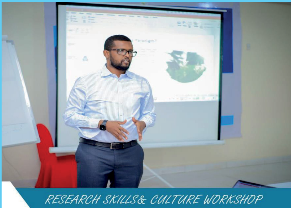
Facilitators during the Research Skills workshop

In 2023, ISIR continued with a series of trainings as part of ISIR's strategic objectives to empower and enable aspiring young researchers to excel in their profession. ISIR aims to build a network of researchers who are home-grown and based within the region of the Horn of Africa. The course facilitators reinforced the participants' knowledge of research and analysis topics important for early career researchers; the researchers are also set to receive mentorship for one year as they research a topic of choice. The training sessions were conducted through lectures, tutorials, and working groups.