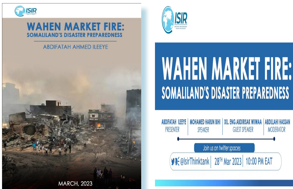
Poster of X space to discuss the Wahen Market Fire

Occasionally, ISIR publishes research papers, opinion pieces, and analyses on cross-cutting themes. One such paper in 2023 was the paper on the 'Wahen Market Fire' which took place in Hargeisa, Somaliland in April 2022, leading to the loss and destruction of billions of dollars worth of goods, property, and infrastructure. The paper published by ISIR was an examination of Disaster Preparedness in developing countries, given the rampant growth in urbanization, and common challenges of inferior infrastructural design and poor governance systems. The paper recommended, among others, the development and operationalization of a disaster risk prediction, prevention, and recovery mechanism in Somaliland. The research paper is available here .