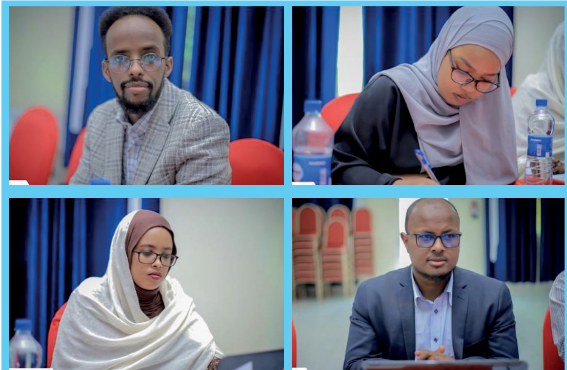
Participants during the Research Skills workshop

ISIR disseminates research findings through reports, journals, traditional media, briefing papers, blogs, films, and our website . The research papers are also available on the ISIR social media pages.